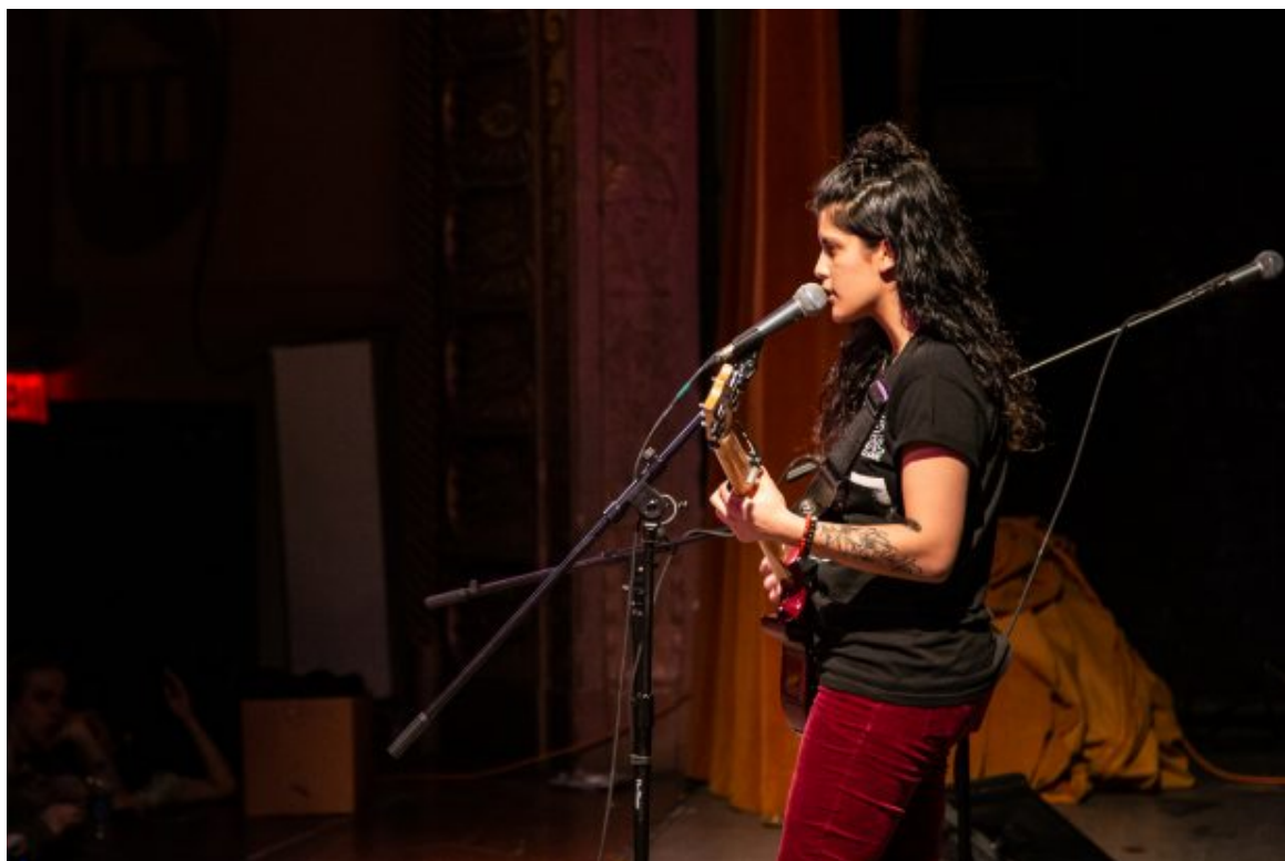
afloat at Philly Battle of the Bands