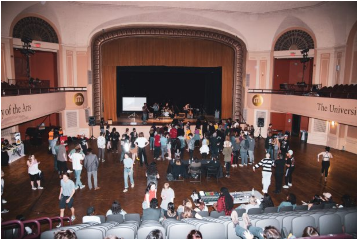
Philly Battle of the Bands