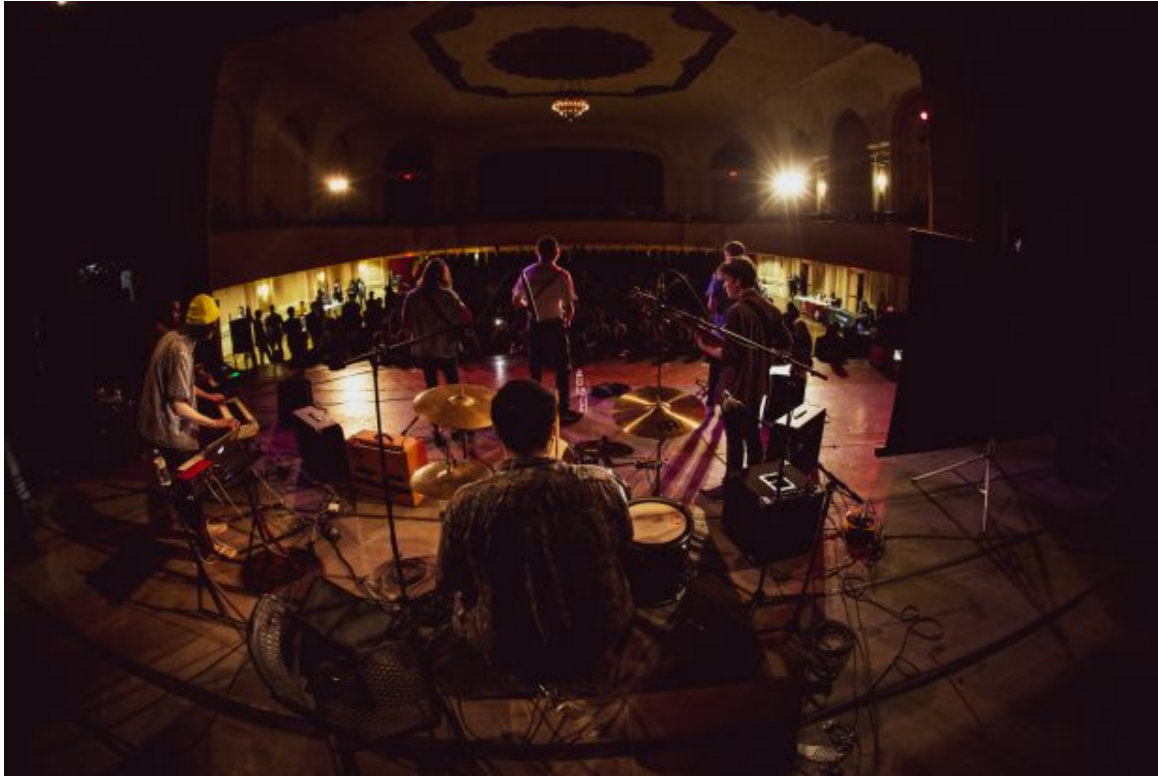
Dangerboy at Philly Battle of the Bands