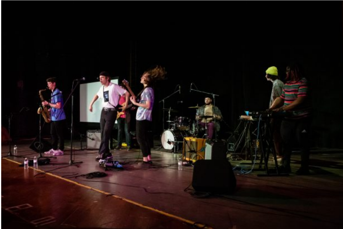
Dangerboy at Philly Battle of the Bands