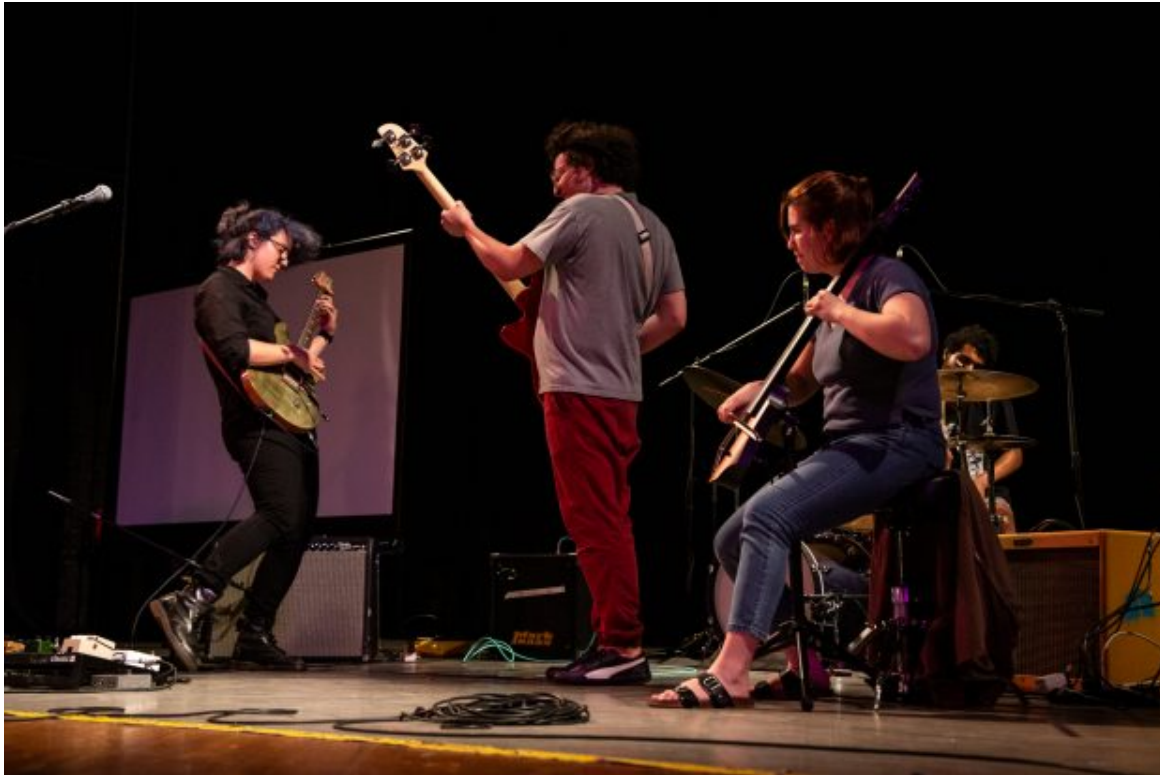
Rally Point at Philly Battle of the Bands | photo by Gabriela Barbieri for WXPB

and last but not least Temple University's Rally Point.